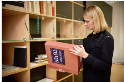
The Marcel Duchamp Inventory and the Serge Stauffer Archive of the Staatsgalerie Stuttgart, photo: Staatsgalerie Stuttgart

The Marcel Duchamp Inventory and the Serge Stauffer Archive of the Staatsgalerie Stuttgart